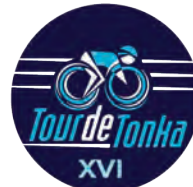
Tour de Tonka August 7, 2021