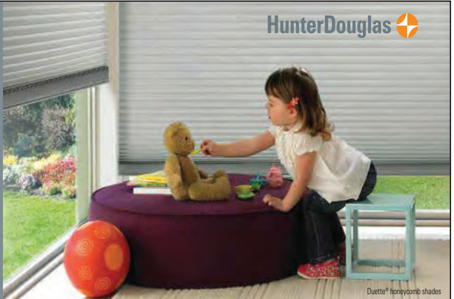
Duette® honeycomb shades

Discover innovative window fashions from Hunter Douglas that enhance safety at the window. Ask today about a wide array of cordless operating systems including the ultimate in operation convenience, PowerView Motorization.