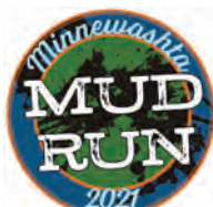
Minnewashta Mud Run July 10, 2021