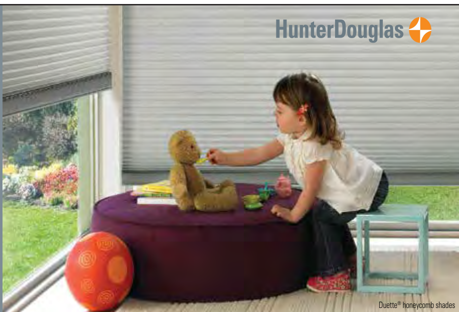
Duette® honeycomb shades

Discover innovative window fashions from Hunter Douglas that enhance safety at the window. Ask today about a wide array of cordless operating systems including the ultimate in operation convenience, PowerView Motorization.